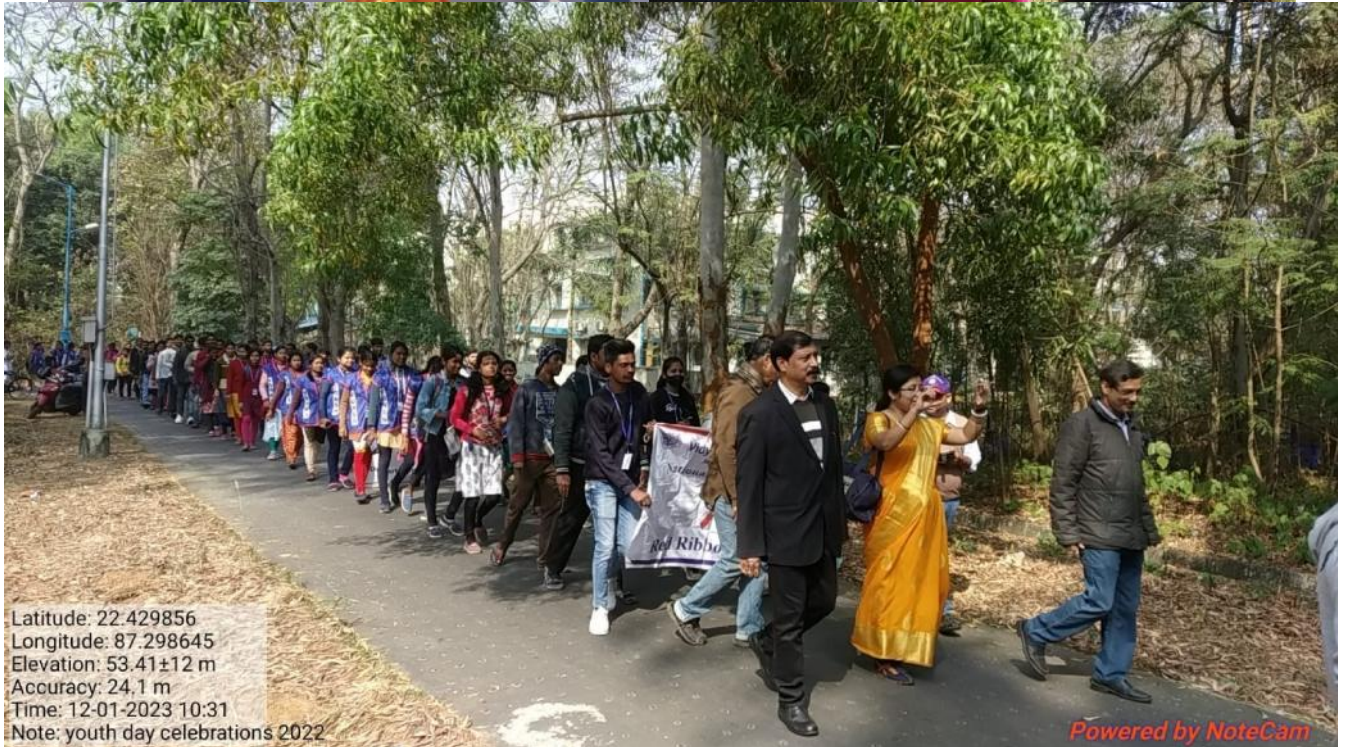
Figure: 161 st birth anniversary of Swami Vivekananda at Vidyasagar University Campus on 12.01.2023.