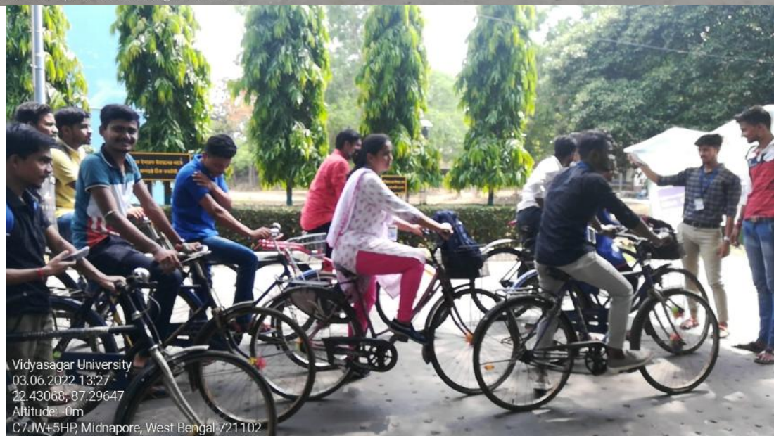
Figure: Programme on World Bicycle day celebration on 3rd June, 2022.