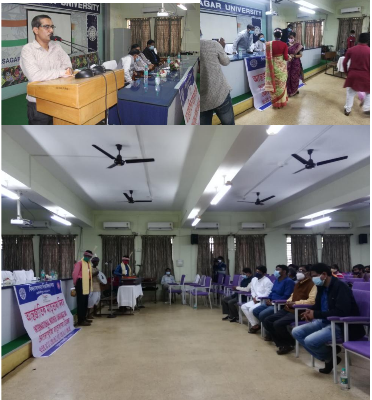
Figure: Programme on International Mother language day on 21.02.2022.