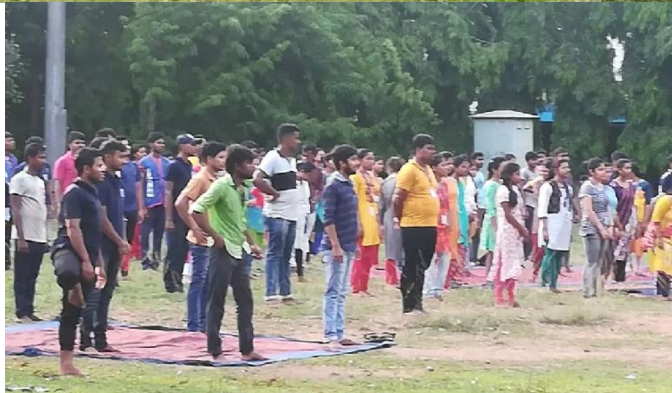
Figure: Programme on Yoga Week celebration on 13-19 June, 2022.