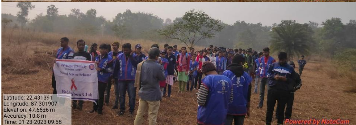
Figure: Netaji Birth Day Celebration on 23.01.2023 at Vidyasagar University Campus.