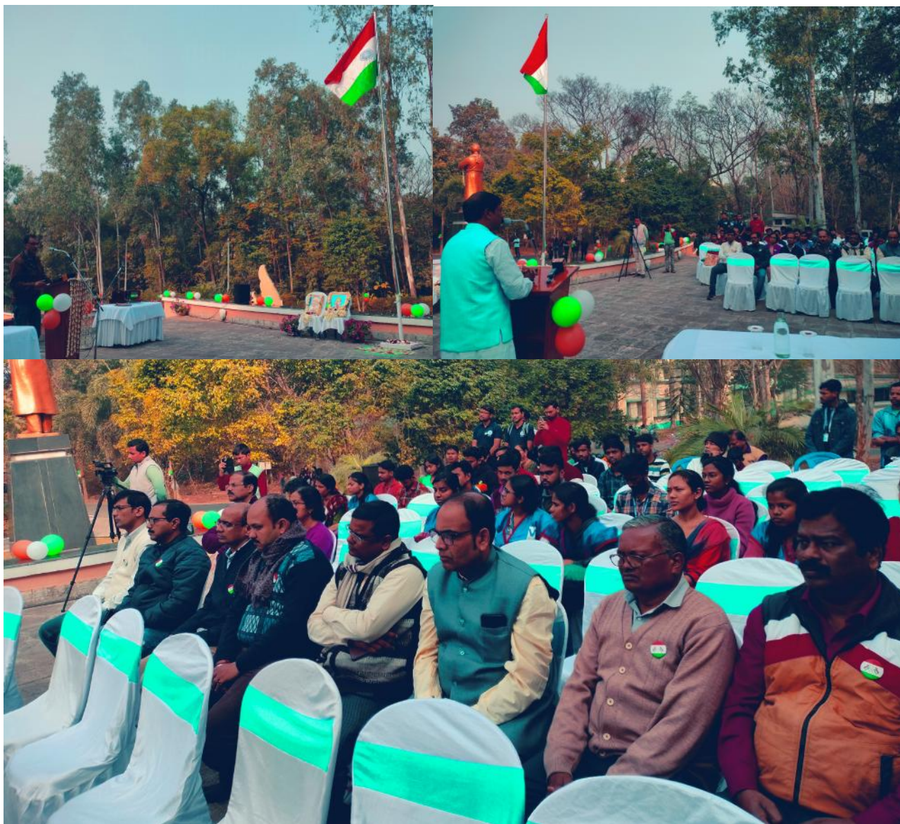
Figure: Republic Day Celebration on 26.01.2023 at Vidyasagar University Campus.