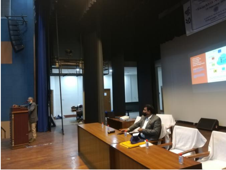
Figure: Programme on swacchata: Rally, Cleaning and Seminar on 15.02.2022.