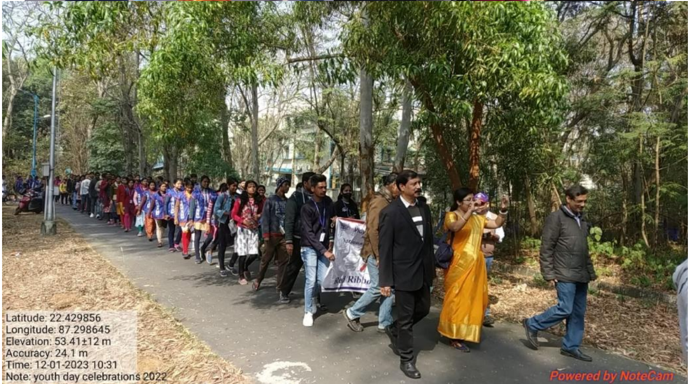
Figure: 161 st birth anniversary of Swami Vivekananda at Vidyasagar University Campus on 12.01.2023.