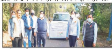
এডস নিয়ে আলি, সেমিনার