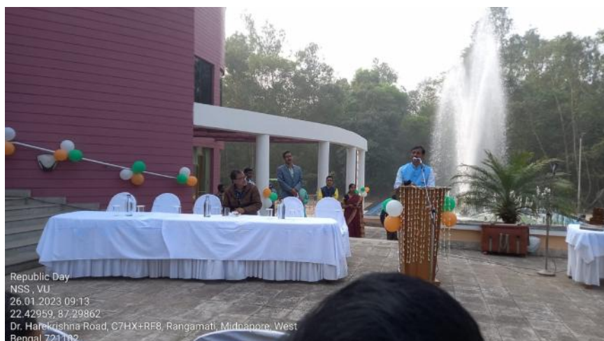
Republic Day NSS, VU 26.01.2023 09:13 22.42959, 87.29862 Dr. Harekrishna Road, C7HX+RF8, Rangamati, Midnapore, West Bengal 721102