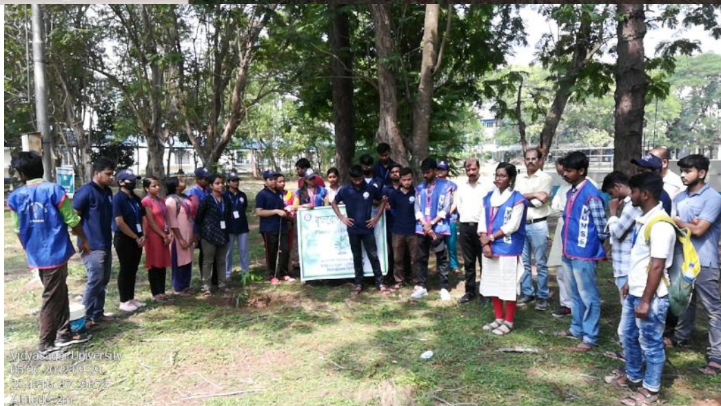
Figure: Programme on World Environment Day celebration on 5 th June, 2022.