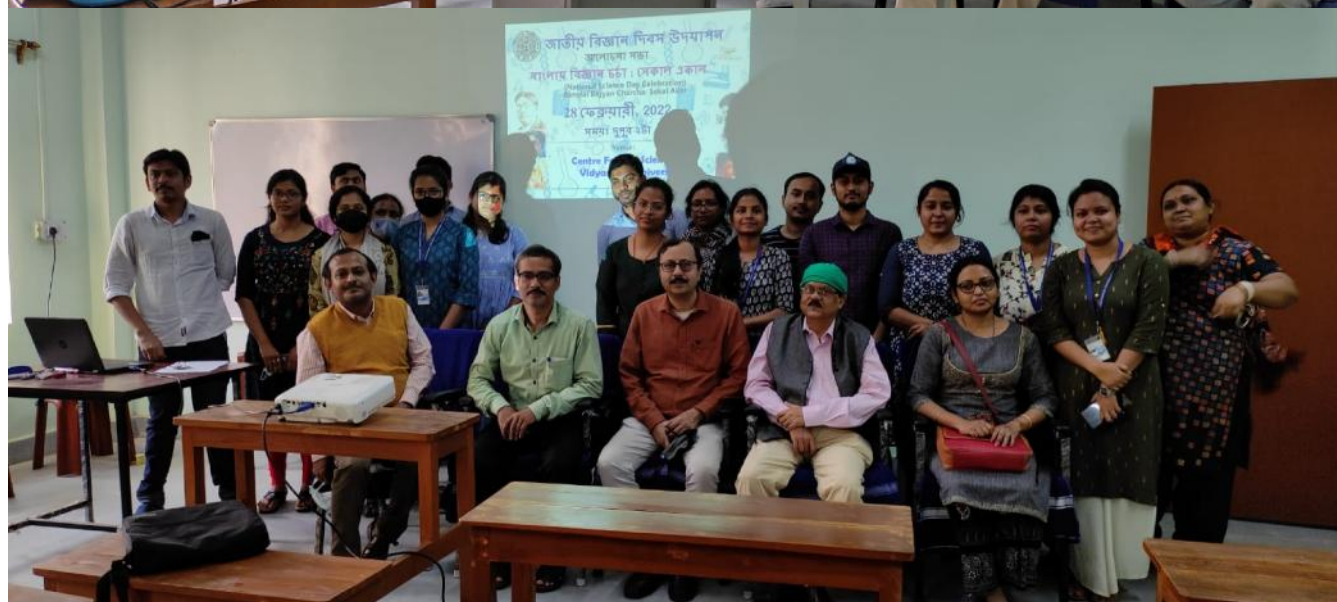
Faculty members and students of Centre for Life Sciences